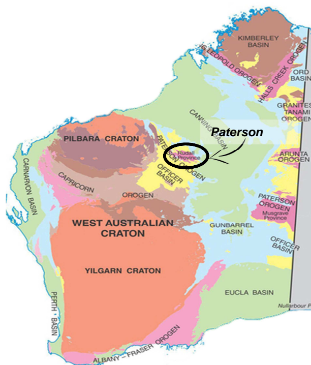
Figure 1 Paterson Province Projects Location Map

Exploration activities have commenced with the acquisition of past exploration data, the assessment of which will inform and shape our exploration work program for the Sunday Creek project.