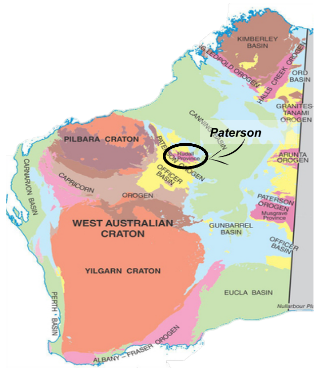
Figure 1 Paterson Province Projects Location Map

Exploration activities have commenced with the acquisition of past exploration data, the assessment of which will inform and shape our exploration work program for the Sunday Creek project.